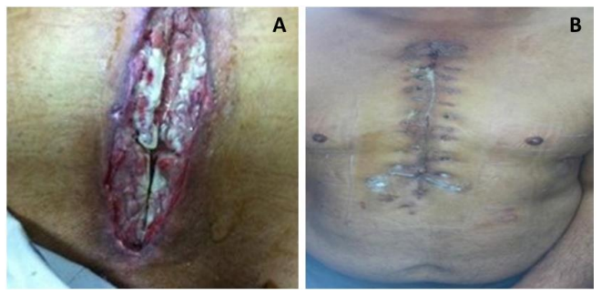
Figure 2: A male patient with deep sternal wound infection who was treated conservatively. (A) Before the start of treatment. (B) After rewiring the sternum with bilateral pectoral flaps

The extent of closure of sternal wounds depended on their size, type, depth, and presence of residual soft tissue defects. Patients with small superficial defects were allowed to close by secondary intention. Large defects were closed surgically by different methods, such as rewiring of the sternum, interrupted suturing to the subcutaneous space and skin, or reconstructive surgery with a pectoral or omental flap, based on defect size, viability of the sternum, and surgeon preference.