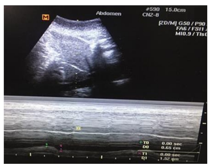
Figure 1: Measurement of inferior vena cave diameter using M- mode

All patients had their central venous catheters inserted aseptically in the internal jugular vein, and a chest x-ray confirmed their correct position. A critical care physician and a licensed practical nurse took the CVP readings for the study. A transducer is used to assess central venous pressure at the location where the fourth intercostal space and the midaxillary line meet. After zeroing, the transducer was kept open for a while so that blood could flow into the central venous catheter. The waveform of central venous pressure and the average central venous pressure in mmHg were displayed on the monitor.