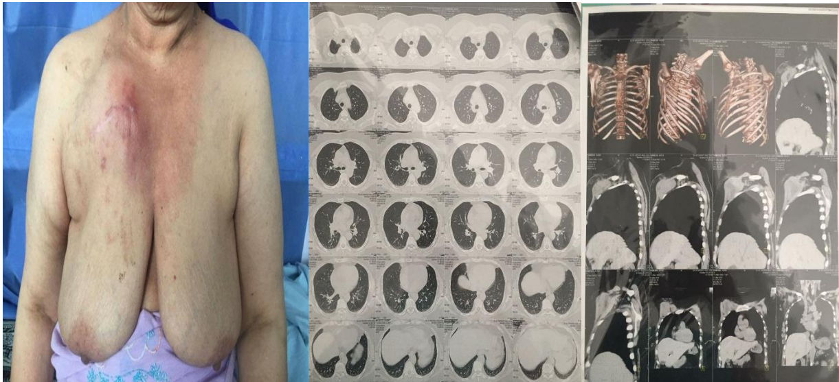
Figure 1: first picture from the left shows large fixed chest wall mass infraclavicular, previous surgical scar seen over it. CT shows extra thoracic subpectoral mass with close relation to the clavicle and no bone erosion

reconstruction with myocutaneous latissimus dorsi (LD) flap at the same sitting.