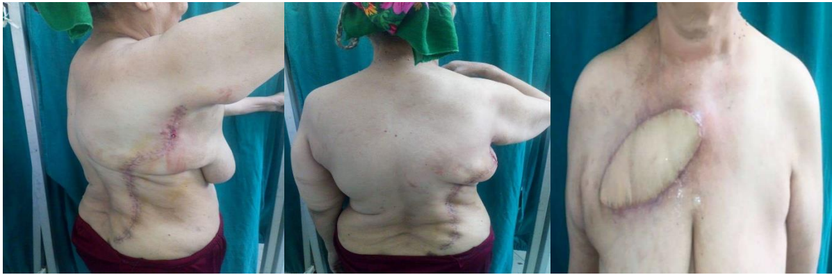
Figure 3: shows scar of the donar site, good function of the right arm and healed LD flap

The harvest of the LD flap and transfer were carried out while the patient in the lateral decubitus position. The initial incisions around the skin island are made with a knife and deepened with cutting diathermy until the distinct Scarpa's fascia was seen. The dissection of the flap can either be superficial or deep to the distinct fascia. In obese patients, dissecting through the fat above this layer leaving a thick layer of subcutaneous fat can be done. As the dissection continues superiorly in the direction of the axilla, from lateral to the outer border of the scapula, and just above its inferior angle the plane of dissection is deepened to the muscle surface and continued superiorly until the cut edge of the divided muscle is reached and the dissected axillary space is connected. The flap is rotated 180 pushed through the axilla to the breast (Figure 2). The donor area was closed in three layers using two suction drains to avoid any seroma or hematoma collection postoperatively.