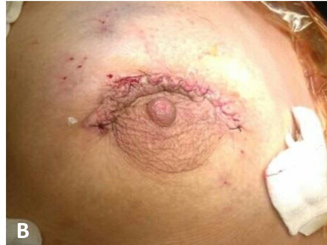
Figure 2: Right mini-thoracotomy via: A) infra-mammary 6-cm incision, B) Periareolar incision