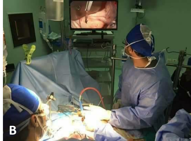
Figure 1: Mitral valve replacement performed: A) combination of direct vision & thoracoscopic assistance, with the use of (Obadia) set of minimally invasive instruments; B) Video-assisted minimally invasive mitral valve replacement through right mini-thoracotomy

After complete cardiac arrest, the left atrium was opened and the mitral valve was exposed. Mitral valve replacement was performed with partial or total chordal preservation and under a combination of direct vision and thoracoscopic assistance through three-dimensional videoscopic guidance, with the use of special set of minimally invasive instruments, (OBADIA set) (created by Obadia J F, Hôpital Louis Pradel - Lyon - France) (Figure 1A). We performed some surgical steps with video assistance, such as placement of sutures on the anterior annulus of the mitral valve, or the area of the posteromedial commissure.