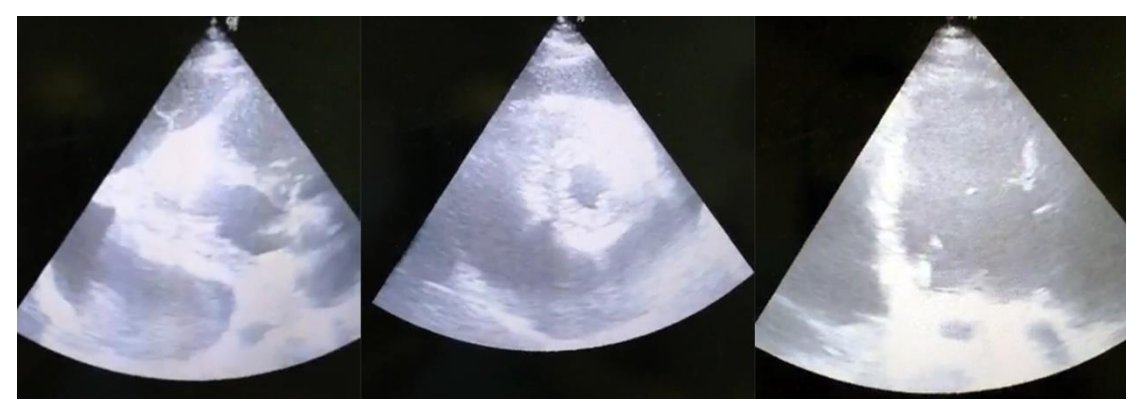
Figure 1: Transthoracic echocardiography showing massive pericardial effusion.

We followed the declaration of Helsinki regarding studies on human subjects [8]. Approvals of the Institutional Research Board were obtained. Informed written consent was obtained from all cases after the explanation of